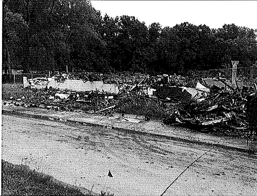
View from A Street SW